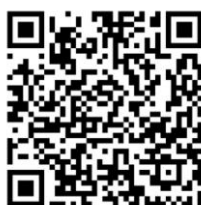
DIAGRAM IS NOT TO SCALE & IS FOR ILLUSTRATIVE PURPOSES ONLY ALL SPACINGS TO BE DETERMINED BY THE COMPETITOR SCAN HERE FOR GENERAL RULES