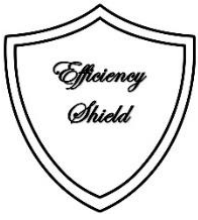
Hereford Times Efficiency Shield