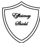
Hereford Times Efficiency Shield