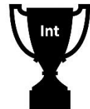
CL Coxon – Int. Competitions Cup

Marks will be awarded to the County Efficiency Shield at the rate of 100 for the highest score, reducing by 10 marks down to 10 th position. An extra 10% of the marks will be added on for entering.