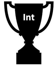
CL Coxon – U21s Cup