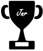
Junior Competitions Cup

Points from the Autumn Live & Carcase Competition will be awarded to the following end of year trophies 2018/19.