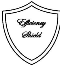
Hereford Times Efficiency Shield